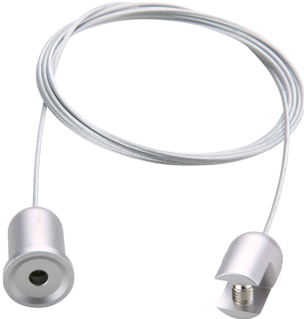
Satin Chrome Suspended Cable With Ceiling To Sign Fixings