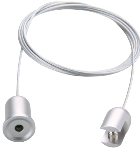
Satin Chrome Suspended Cable With Ceiling To Sign Fixings