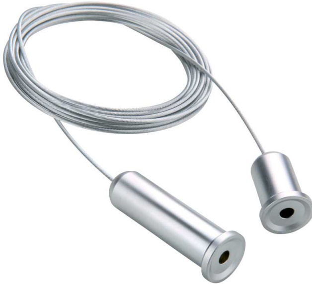
Satin Chrome Cable With Floor To Ceiling Fixings