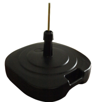
Above: Flag base Below: Ground spike